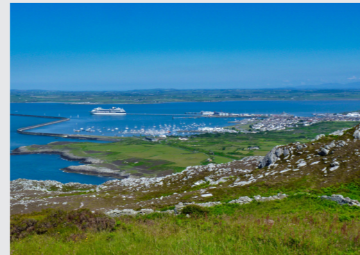
ABOVE: The UK Government is opening two new freeports in Wales, bringing new jobs and investment.

The Freeport programme is part of the UK government's plan to level up investment in jobs and skills in North Wales and across Britain.