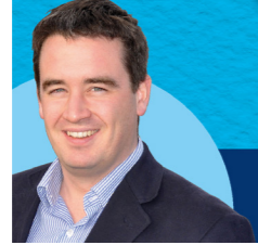
Dr James Davies MP

Sign my petition to oppose the Welsh Government's new 20 MPH legislation